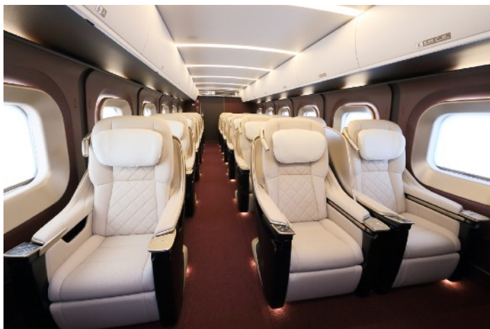
Inside of the GranClass