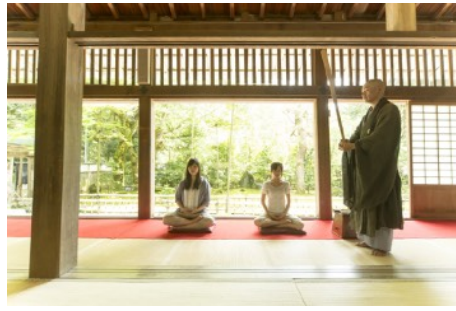
Zazen experience at Daianzenji