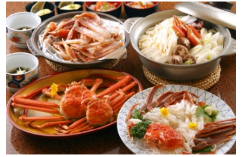
Echizen Gani Crab

The new extension of Shinkansen service to several stations in Fukui Prefecture will allow easier access to many interesting sites. In Fukui you can relax and enjoy yourself with a hot springs experience, or a day of Zen meditation, or just sampling the delicious crab from the Sea of Japan. The following are just a few of Fukui's offerings: