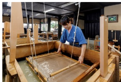
Echizen washi paper