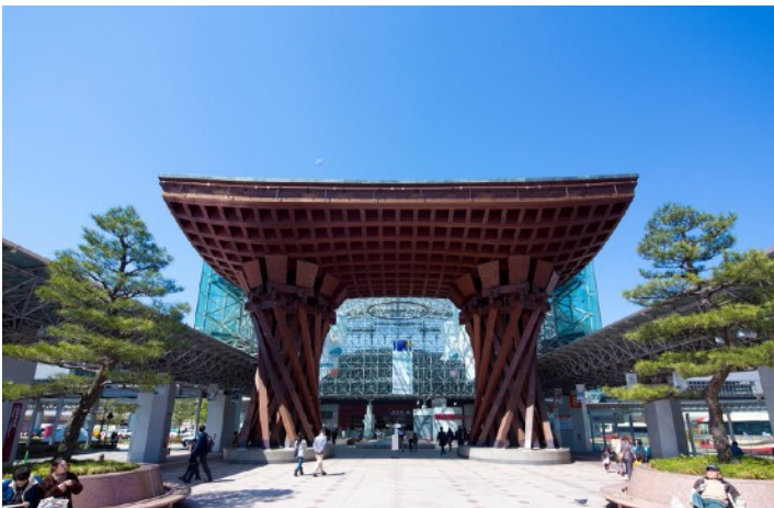
Tsuzumi-mon Gate at Kanazawa Station